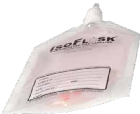
Not full enough